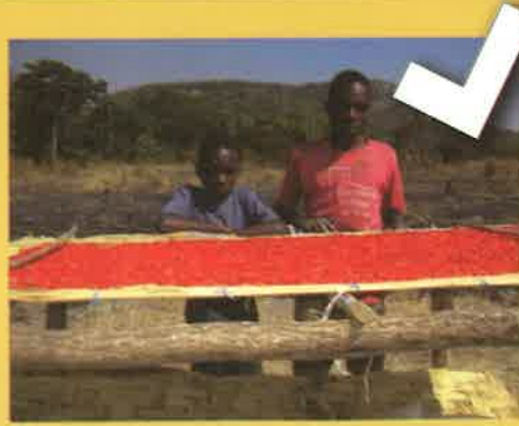
Dry fruits on a raised platform