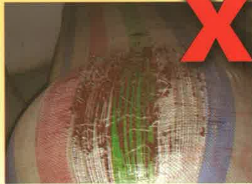
Do not pack in torn sacks