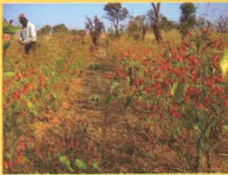
Harvest only mature fruits