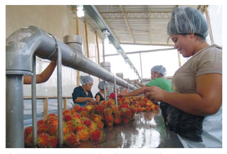
The project team surveyed and interviewed representatives from all sectors of the horticultural value chains in Honduras and Guatemala to write the report.