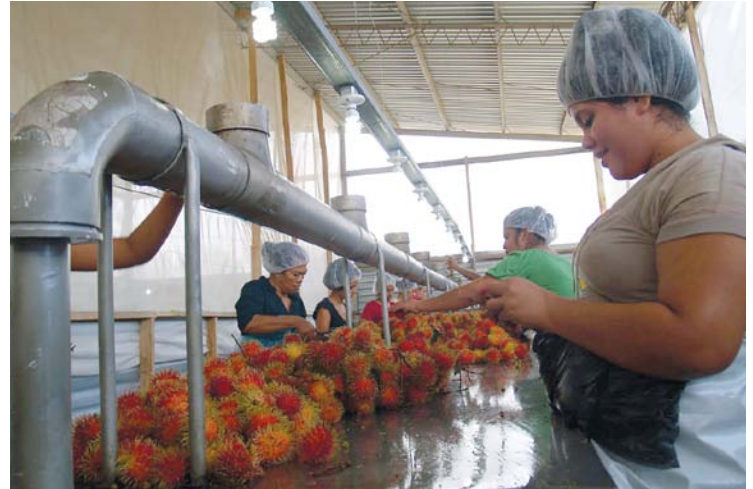
The project team surveyed and interviewed representatives from all sectors of the horticultural value chains in Honduras and Guatemala to write the report.