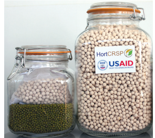
Reusable drying beads improve germination and plant vigor if used to dry horticultural seeds. The beads are being rapidly adopted by Bangladesh seed companies.