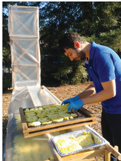
Designed by UC Davis researchers for the Horticulture Innovation Lab, the chimney solar dryer combines solar heat collection with rapid air flow for efficient drying of fresh produce.