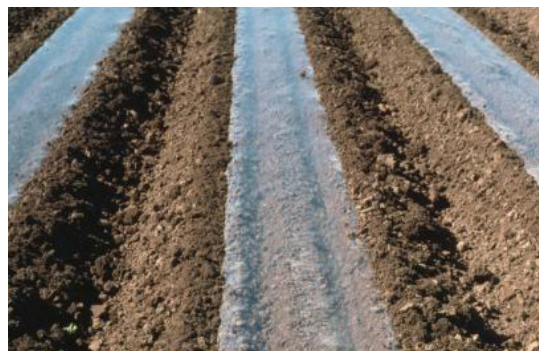
Facilitated solarization can speed up the standard soil solarization process with the addition of insulation to reduce heat loss at night.

Facilitated solarization reduces the time needed by covering the clear solarizing plastic with an insulating layer at night to reduce the heat lost during cool nights. First, prepare beds and irrigate soil down to about 30 cm, as wet soil better conducts and holds heat. Then place clear plastic directly over the soil, and secure by burying the edges in a trench around the beds. Just after the hottest time of the day, apply insulation materials, such as wool, fiberglass, old blankets, bags packed with rice hulls or chicken feathers. Remove the insulation in the morning as the sun is rising and store in a safe location for re-applying in the late afternoon.