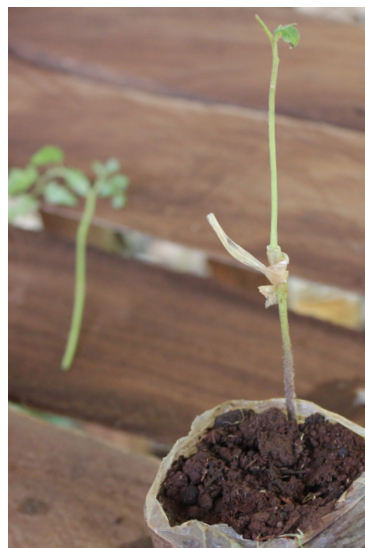
A recently grafted tomato plant, with scion above the union (held together temporarily with a plastic tie) and rootstock below. This grafted seedling would next spend a week in a grafting chamber and additional time in a screenhouse before being transplanted in a field.

Immediately after the seedlings are grafted together, plants are placed in a grafting chamber for about one week with high humidity and reduced light intensity for the graft union to heal. The grafted seedlings are further “hardened” in a screenhouse to prepare for transplanting in the field. Depending on growing conditions, the grafting process typically takes about 30-33 days.