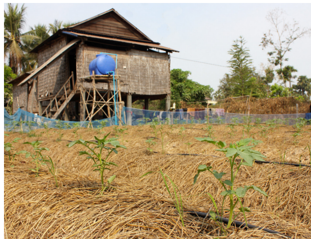
When combining drip irrigation with conservation agriculture to grow vegetables such as these tomatoes on small plots, the drip irrigation tape is installed beneath the mulch layer.

Combining these practices with drip irrigation improves water use efficiency, delivering water more directly to the crop roots and decreasing surface evaporation. Drip irrigation works well with conservation agriculture because the mulch layer reduces the need for weeding, thus reducing potential inconvenience and damage to the irrigation equipment. Field trials have found that the combination of conservation agriculture and drip irrigation can mitigate the temporary yield reductions which are often seen upon first adopting conservation agriculture practices.